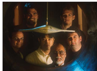
Top: GTRI's Logistics and Maintenance Applied Research Center uses the latest information technology to provide integrated logistics, supply chain management, systems sustainment and predictive diagnostics for the Defense Department.