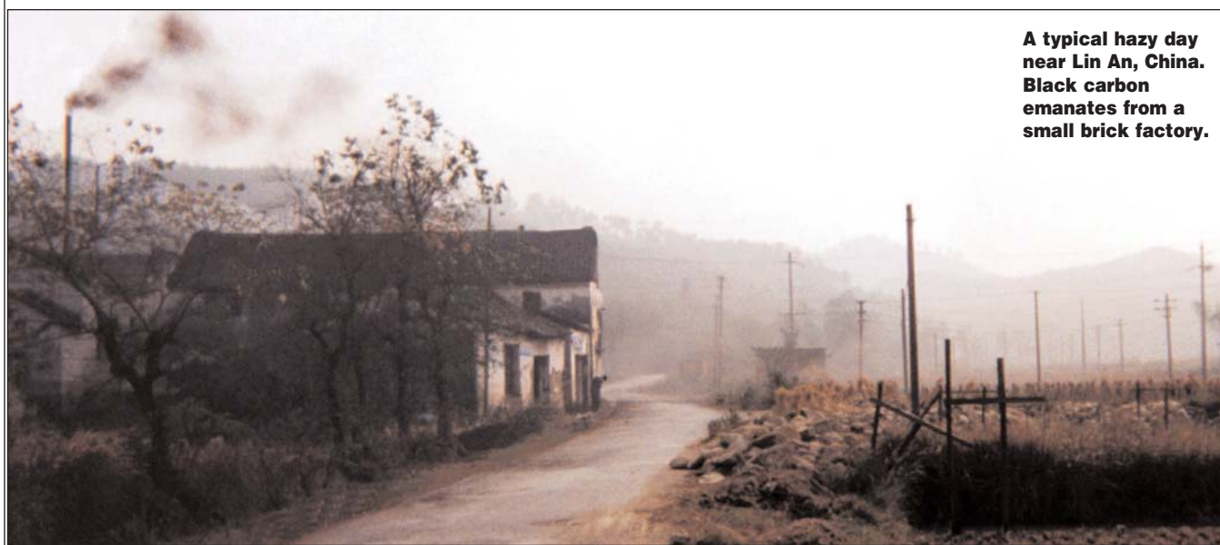
A typical hazy day near Lin An, China. Black carbon emanates from a small brick factory.

Report assessing impact of soot on global warming could shift burden to developing nations and create new uncertainty in climate model predictions.