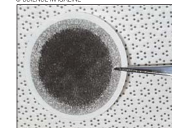
These are aerosol particles collected near Lin An, China on a 47-mm Teflon filter. The blackness of the filter indicates the presence of black carbon.