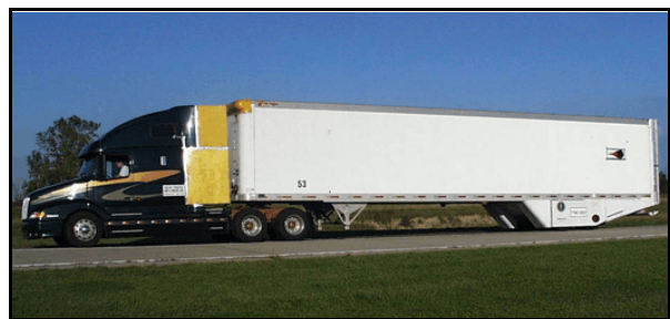
Side view shows aerodynamic improvements made to full-size tractor-trailer truck.

The aerodynamic improvements produced by geometry changes – which generate fuel